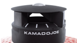
Kontrol Tower Top Vent