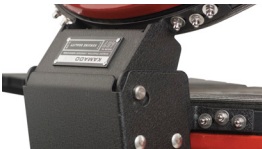
Air Lift Hinge