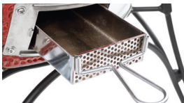
Slide-Out Ash Drawer